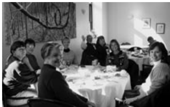
Staff Council members enjoying the Christmas luncheon. December 13, 2005

These are just a few of the events happening in January and February. For a complete listing, go to www.oa.appstate.edu .