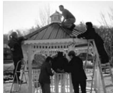
The decorating of the gazebo was a lot of fun, complete with hot chocolate and cookies.